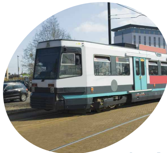
Passenger Tram, Salford Quays

In addition to the benefits of helping to ensure delivery, partnerships can also realise efficiency savings, both for individual stakeholders within the relationship and for the project as a whole. Significant savings may be accrued from a lowered overall total cost of strategically coordinating the planning of infrastructure and development. By developing a good understanding and joint vision of the development of a place, infrastructure providers, developers and local authorities can achieve efficiencies by tailoring their investments based on the requirements of the overall strategy. For example, in the new Cranbrook development within the Exeter and East Devon Growth Point (see Case Study 5 below), the composition of the transport infrastructure in relation to a new business park and housing development – which themselves have all been jointly coordinated – has enabled the development of an innovative district heating and energy plant. The output of the plant is designed to operate on a scale to meet the needs of the local community, with excess production being resold to the National Grid. While recognising that not all developments are large enough to reasonably merit coordinated planning across all forms of infrastructure, it is clear that there are benefits to be accrued from strategically planning developments at scale.