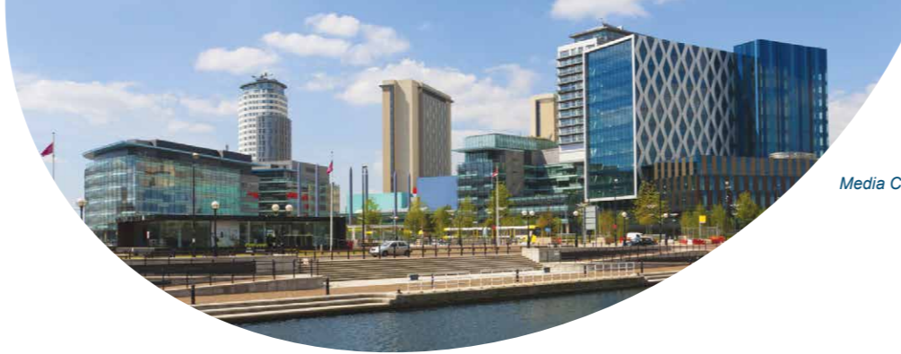
Media City Salford Quays