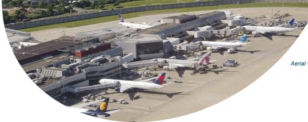
Aerial view of Heathrow Airport