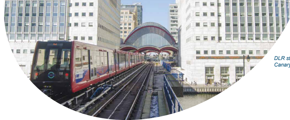
DLR station, Canary Wharf

The reluctance of analysts to fully consider wider benefits may come from bitter experience of past projects which had only political purposes. However, evidence from our round table events suggested that “we probably have fewer projects than we should” as a result of overly-cautious evaluation.