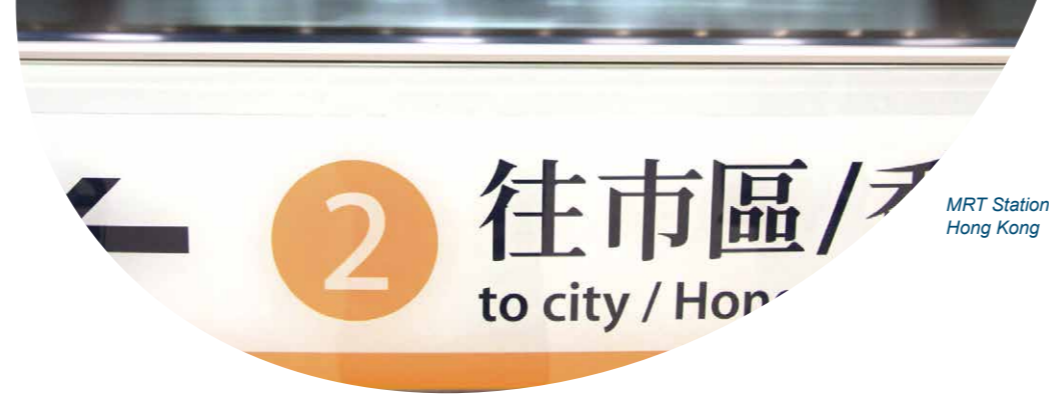
MRT Station, Hong Kong

A fairer and more justifiable system of targeted cost recovery could help remove many of the polemical debates that surround the price tags of high-profile infrastructure projects.