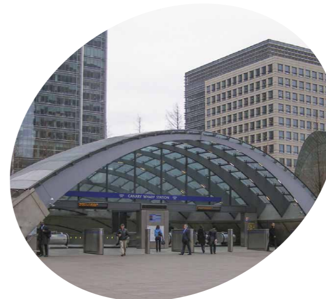
Jubilee Line station, Canary Wharf

Current infrastructure appraisal processes fail to capture the true scale of benefits that can be derived from investment.