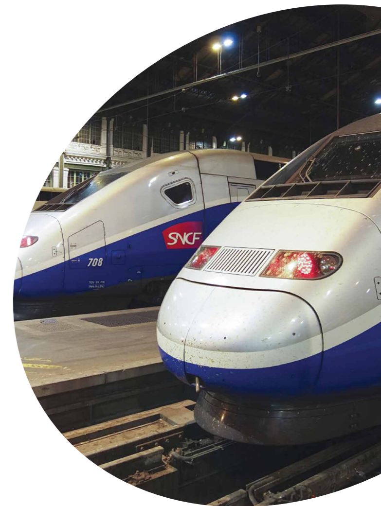
TGV at station

Policy makers need to place greater emphasis on strategic planning and its unique capacity to develop infrastructure to tackle multiple challenges.