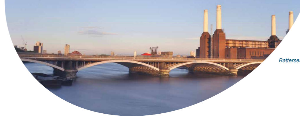
Battersea Bridge and power station