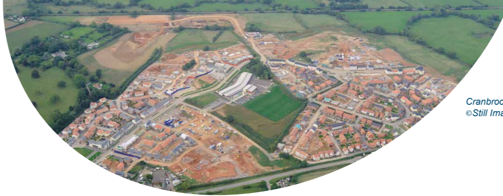
Cranbrook looking North East