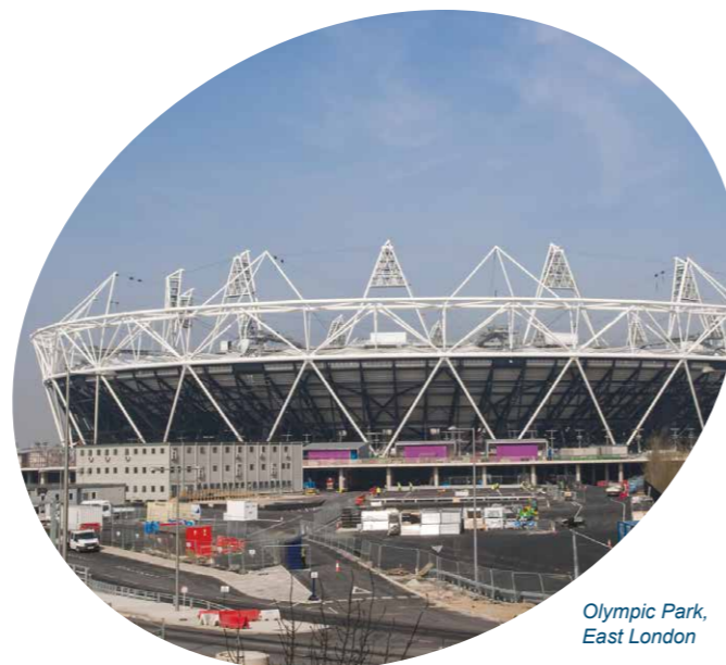
Olympic Park, East London