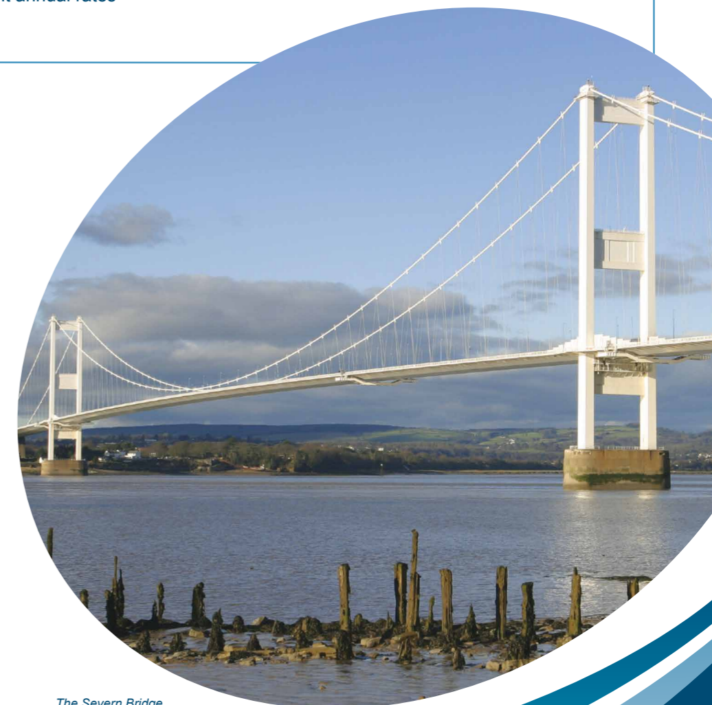
The Severn Bridge

Today, debate continues in South Wales about future infrastructure delivery and whether the benefits outweigh the costs for projects including the M4 relief road south of the Bryn Glas Tunnels and the Cardiff Bay Eastern Link road between the capital and Newport. Whatever the options, the most densely populated area in the South West of the UK, with a functional economic area of 2.2million people, or three quarters of the population of Wales itself, deserves its policy makers to take responsibility for the long term strategy and vision that will deliver economic success for the region.