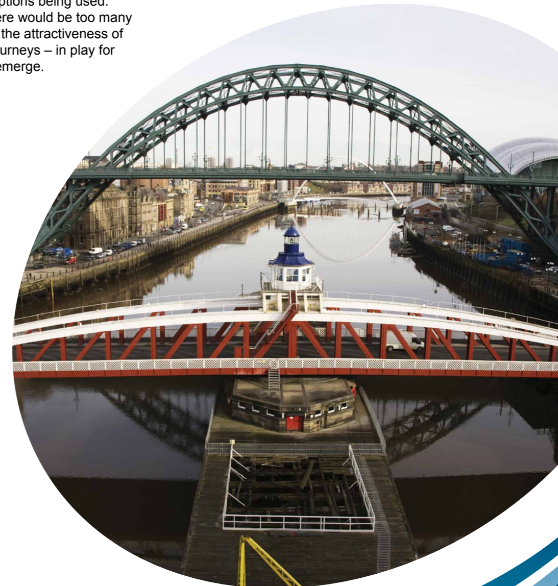
Bridges of the Tyne