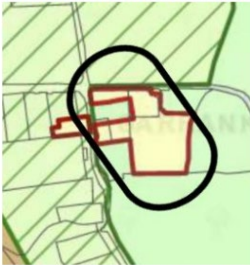
Proposed Material Alteration Zoning = New Residential (Site circled in black).