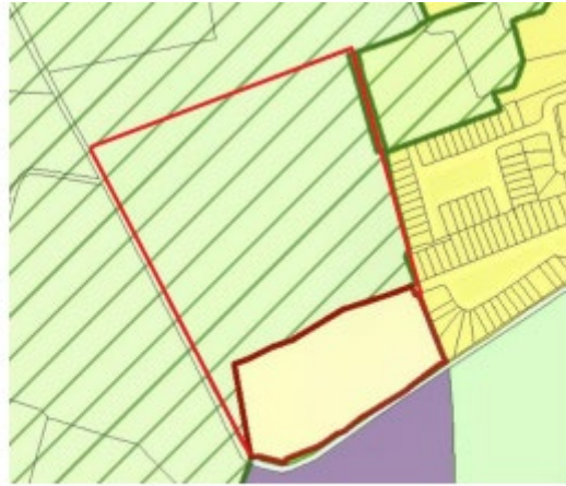
Draft Plan Zoning = Agriculture (outlined in red).