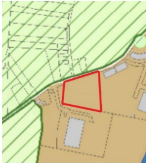
Draft Plan Zoning = Enterprise & Employment (site outlined in red)