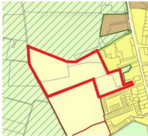
Proposed Material Alteration Zoning = New Residential (Site location outlined in red)