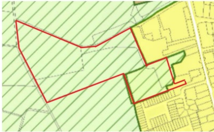
Draft Plan Zoning = Agriculture/Existing Residential (site outlined in Red)