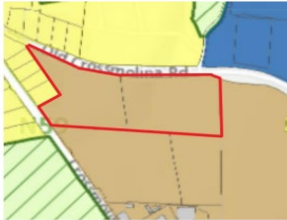
Draft Plan Zoning = Enterprise & Employment (Site outlined in red).