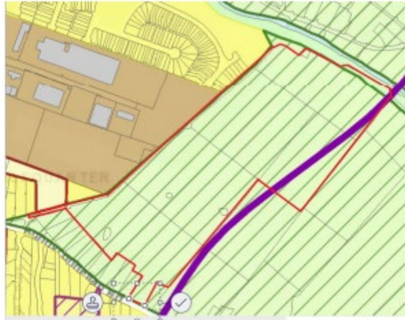
Draft Plan Zoning = Agriculture/Recreation & Amenity (site outlined in red).