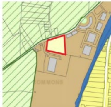
Proposed Material Alteration Zoning = New Residential (Site location outlined in red)