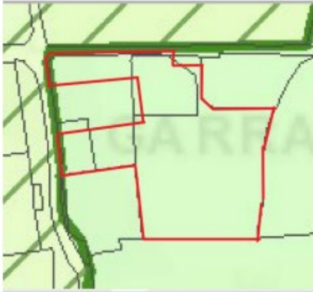
Draft Plan Zoning = Recreation & Amenity (site outlined in red).