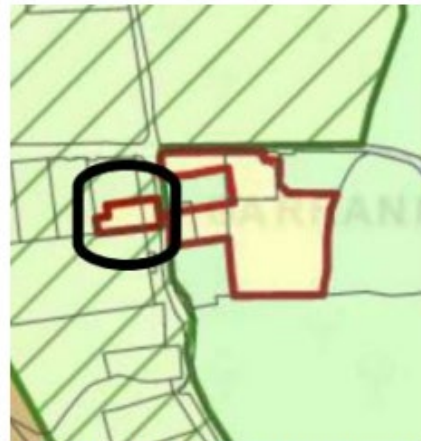
Proposed Material Alteration Zoning = New Residential (Site circled in Black)