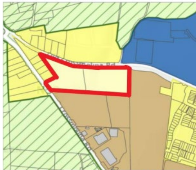
Proposed Material Alteration Zoning = New Residential (Site outlined in red).