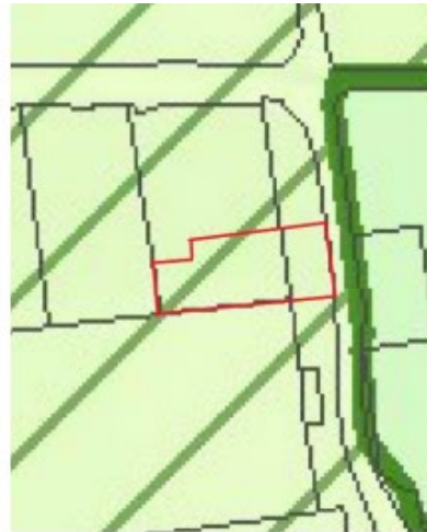
Draft Plan Zoning = Agriculture (outlined in red).