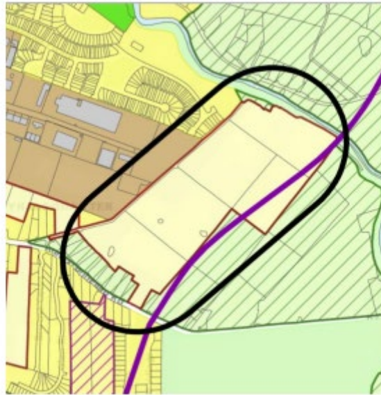
Proposed Material Alteration Zoning = New Residential (Site circled in black).